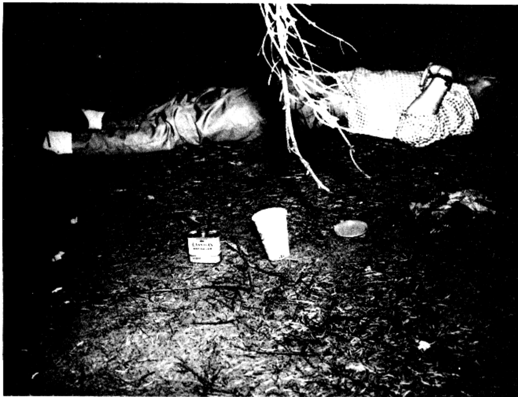
Figure 1. The answers will not always be this apparent.

(2) Samples of food, medicines, beverages, narcotics, or similar materials that the victim may have consumed. Sinks, pipes and drain traps, garbage cans, cupboards, and refrigerators may contain evidence of the poisonous substance involved. Samples of material such as spices, sugar, flour, and baking soda should be taken, if appropriate, since poison can be easily concealed in such substances. Spilled liquids may be collected through allowing their absorption into a filter paper, which is then placed in a clean glass jar and tightly sealed.